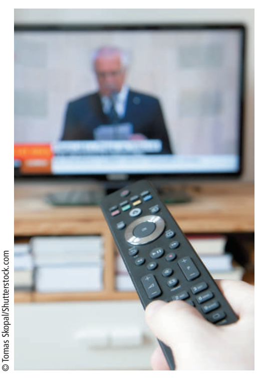
How did the invention of cable television influence advertising?

Cable television, developed in the 1970s, was the next great innovation to impact the advertising industry. It offered more channels with specific program offerings. Advertisers could now narrow the demographics of their intended audiences. Before the advent of cable television,