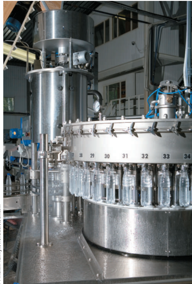
How did mass production affect advertising?

Advertising has responded to changing business, media, and cultural trends over time. As it evolved, it encouraged Americans to take an